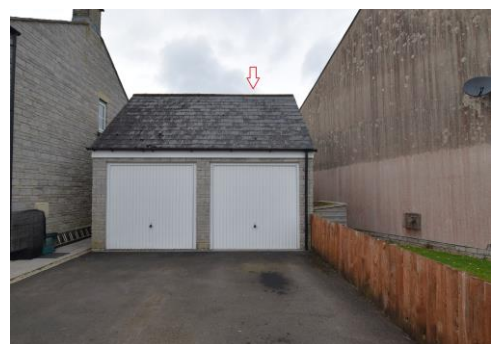
'A modern terraced home with an attractive low maintenance garden plus there is a garage and driveway parking!'

This two bedroom mid terrace home is offered for sale with no onward sales chain making this an attractive option for many buyers! The property has good size accommodation comprising a good size lounge with stairs to the first floor and a kitchen/dining room across the rear overlooking the garden. There is also a rear lobby with door to the garden and a ground floor wc. On the first floor there two pleasant sized bedrooms as well as a bathroom with shower over the bath. GCH and double glazing.